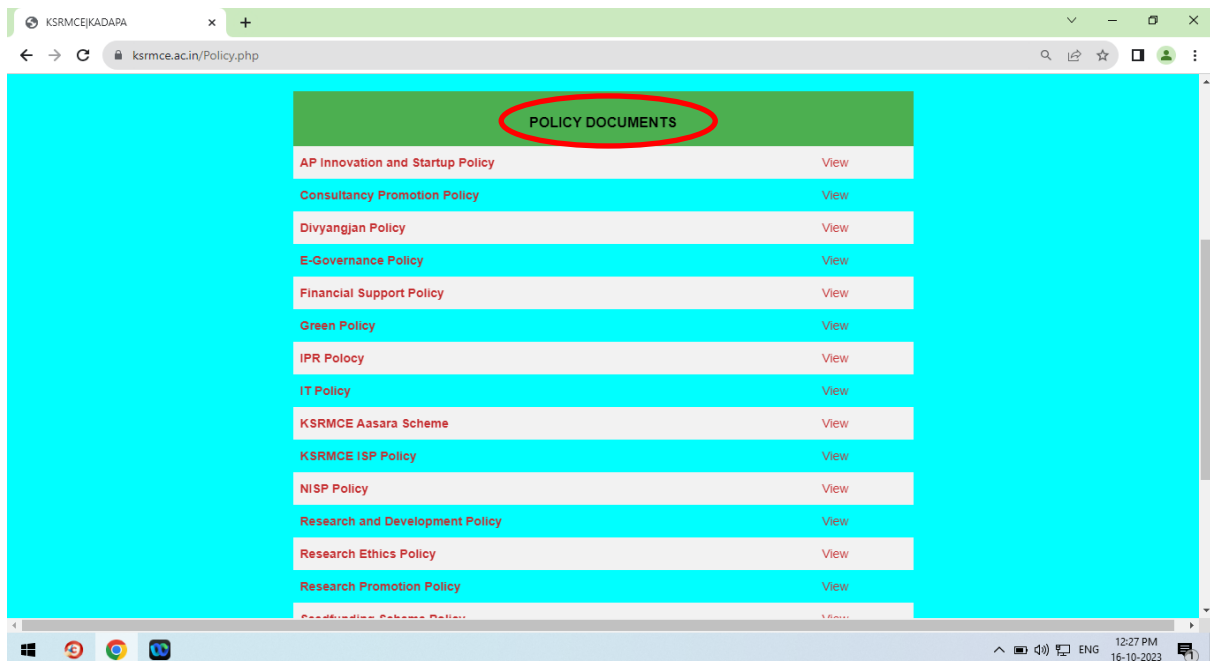
Photographs Specifying Availability of Policy Documents in KSRMCE Website