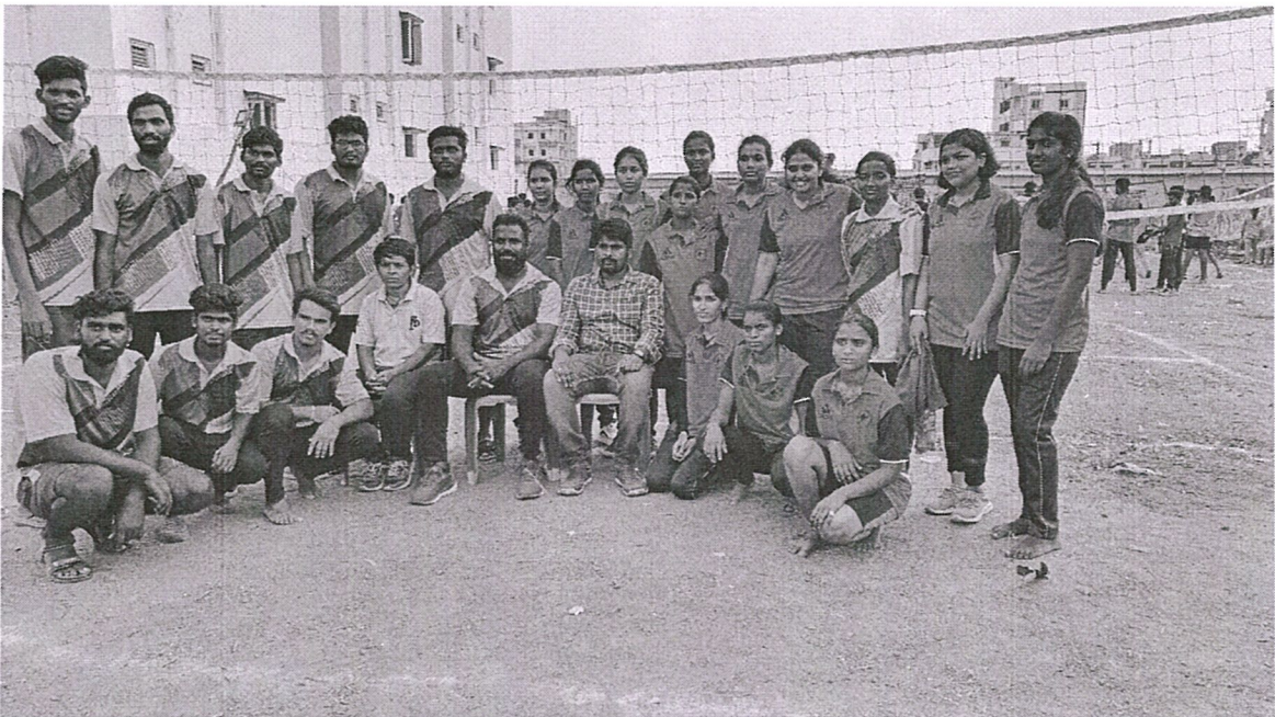
Shooting Ball Men and Women team